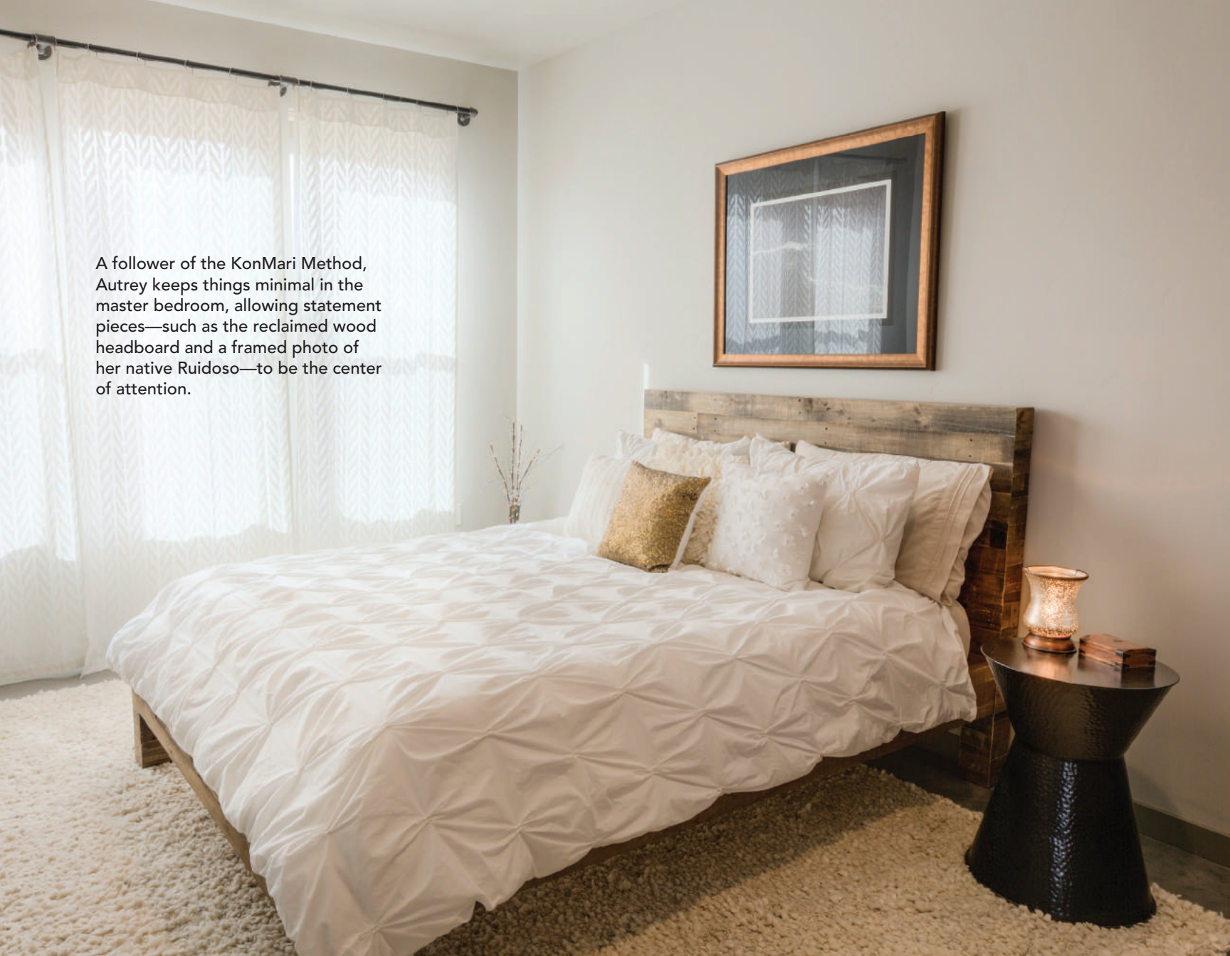
A follower of the KonMari Method, Autrey keeps things minimal in the master bedroom, allowing statement pieces—such as the reclaimed wood headboard and a framed photo of her native Ruidoso—to be the center of attention.