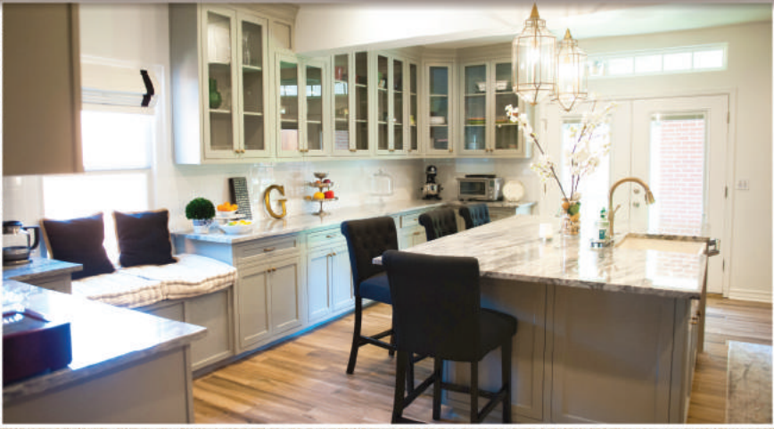
Complete Custom Kitchen Design