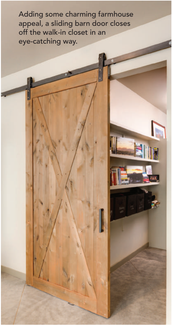
Adding some charming farmhouse appeal, a sliding barn door closes off the walk-in closet in an eye-catching way.