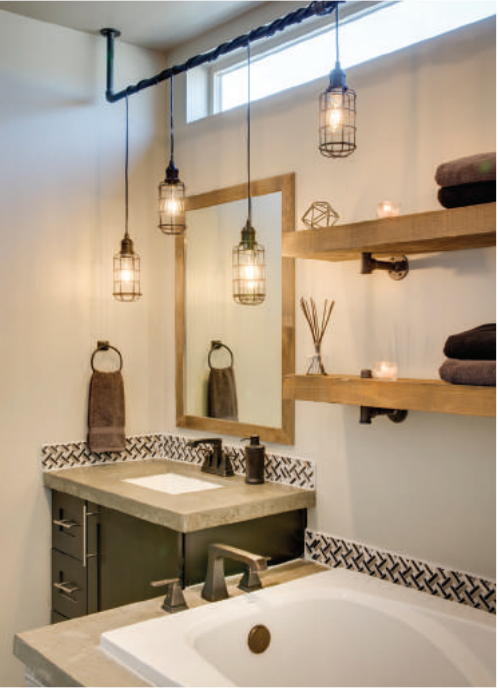
Below: Style and function: Edison-style pendant lights echo the home's industrial design and add a glow to the relaxing master bath. Open shelving gives the feeling of more space overall.