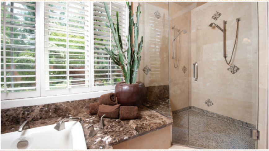
Full Bathroom Remodeling