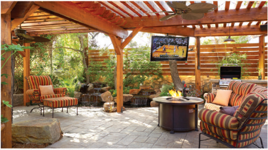
Patios - Pergolas - Fireplaces - Cooking